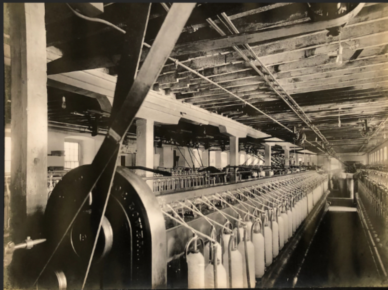
Carding Room - Showing Cards, Drawing Frames and Spindles.