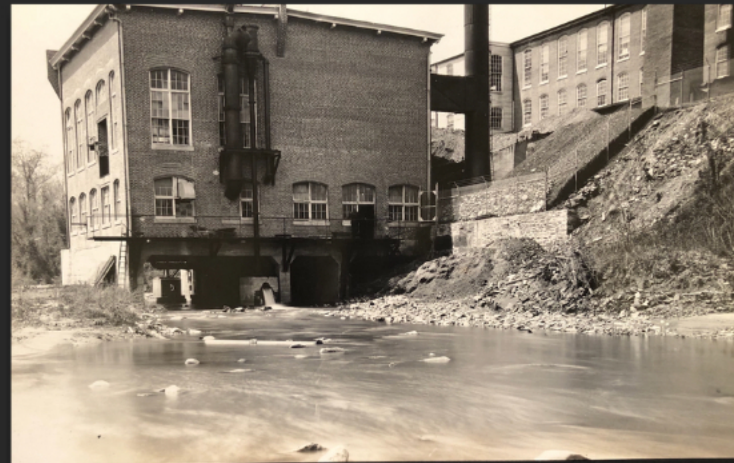
Power Plant - Showing Hot Well, Steel Platform and Retaining Wall.