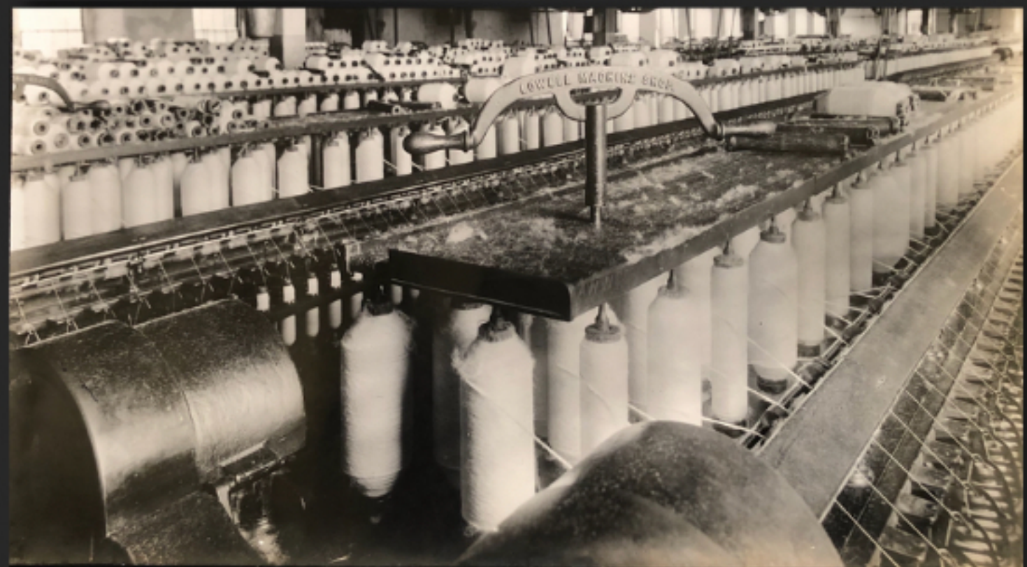
Spinning Room - Showing Spinning Frames. The cotton at this stage has been made into